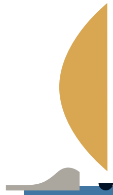
GR-Athens workshop-Feb 2014 Final

In total (25) M-Ss participated in the Workshop